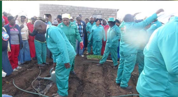
Department officials together with community members from Nkomazi Municipality, doing their part for Mandela Day