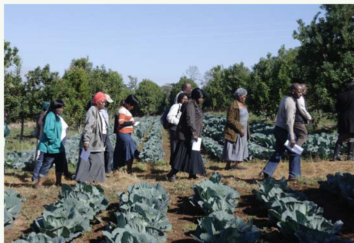
Field visit by farmers, officials from the Department of Water Affairs, ARC, DAFF and Dardla

The activities on the day included field visit and presentations from the Department of Water Affairs on Water Rights, ARC on Mushroom Production and drying of vegetables and fruits, DAFF on CLARA and Dardla on Land Access, Market Access, Masibuyele Esibayeni, Masibuyele Emasimini and Soil Sampling.